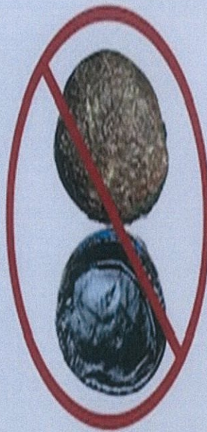
Ordinary Blackfoot Pāua

A Rāhui/prohibition is in place for this area for pāua. No persons can take or possess pāua taken from East Otago Taiāpure area (please refer to the map above).