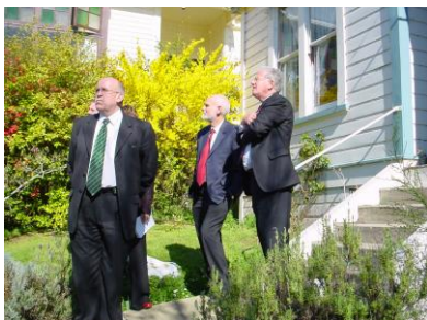
David Benson-Pope, Pete Hodgson, Dr Michael Cullen